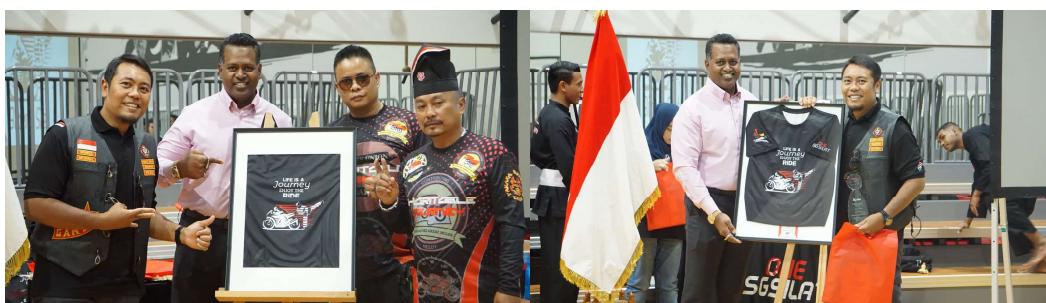
Bikers-Silat Steering Committee.